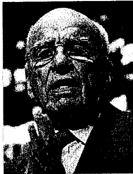
Don Emmert/Agence France-Presse — Getty Images