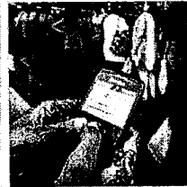
India's Surveillance Plan Said to Deter Business