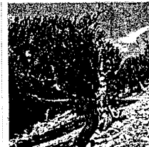
The Oldest Trees May Soon Meet Their Match