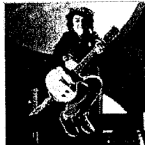
Rocker Follows His Work Onto a Broadway Stage