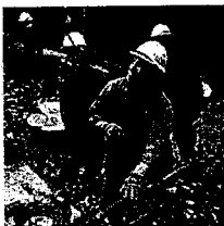
Urban Turn for Workers Accustomed to the Forest